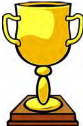
DESS B Team – 1 st Place